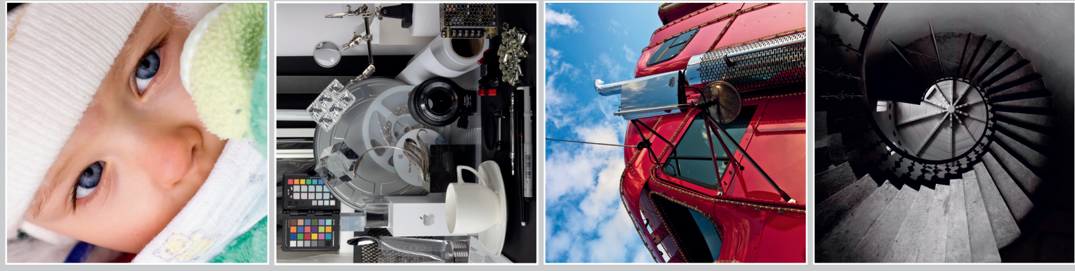
i1, eXact, MYIRO-1